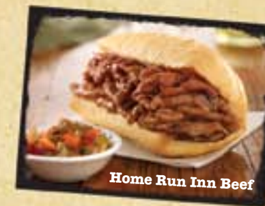
Home Run Inn Beef

Grilled chicken topped with roasted red peppers and tangy bistro sauce, baked with mozzarella cheese.